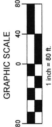
EXHIBIT "B" LAFCO 23-0X

for 1330 SAN ANTONIO CREEK ROAD / APN 059-440-008 ~ COUNTY OF SANTA BARBARA ~ ~ STATE OF CALIFORNIA ~ ~APRIL 2023~