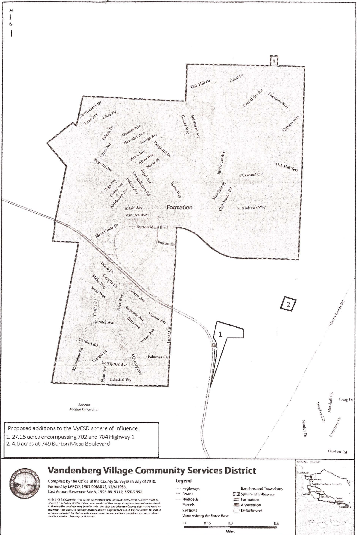
Figure 1. Proposed Additions to VVCS D Sphere of Influence.