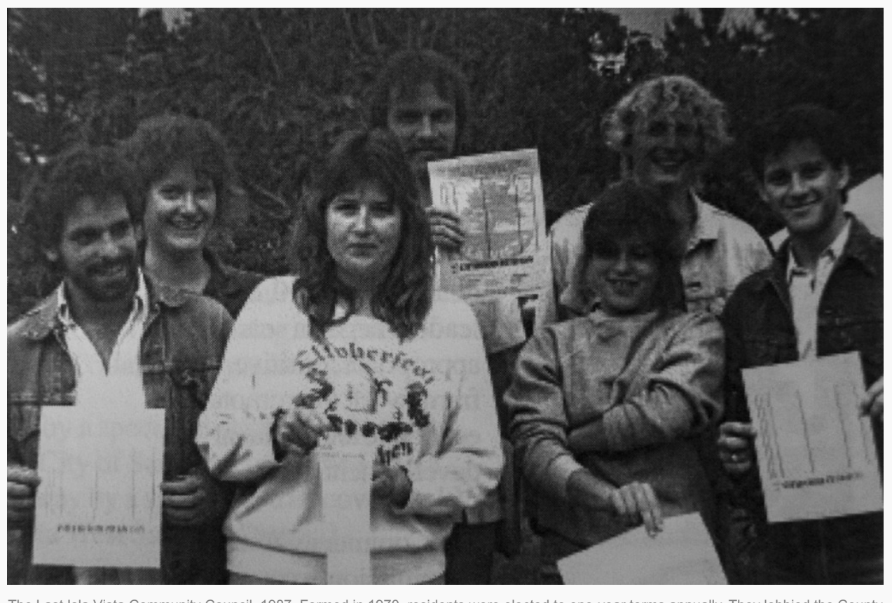
The Last Isla Vista Community Council, 1987. Formed in 1970, residents were elected to one-year terms annually. They lobbied the County and University in support of community positions.

Although Isla Vista tried and failed for cityhood in 1973, the I.V. Community Council (IVCC) made several other attempts to give I.V. a more sustainable form of government in the years following.